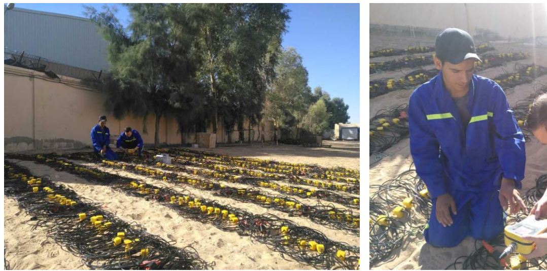
SD7M-10 in the field