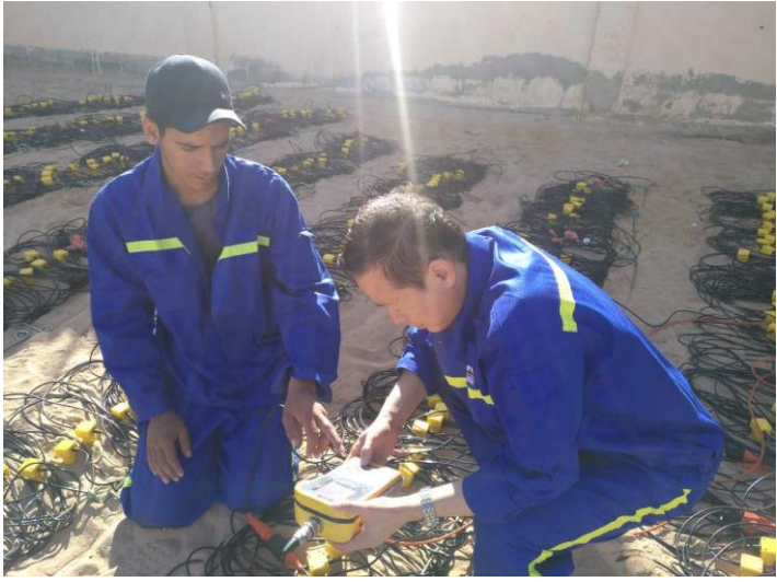
SD7M-10 in the field