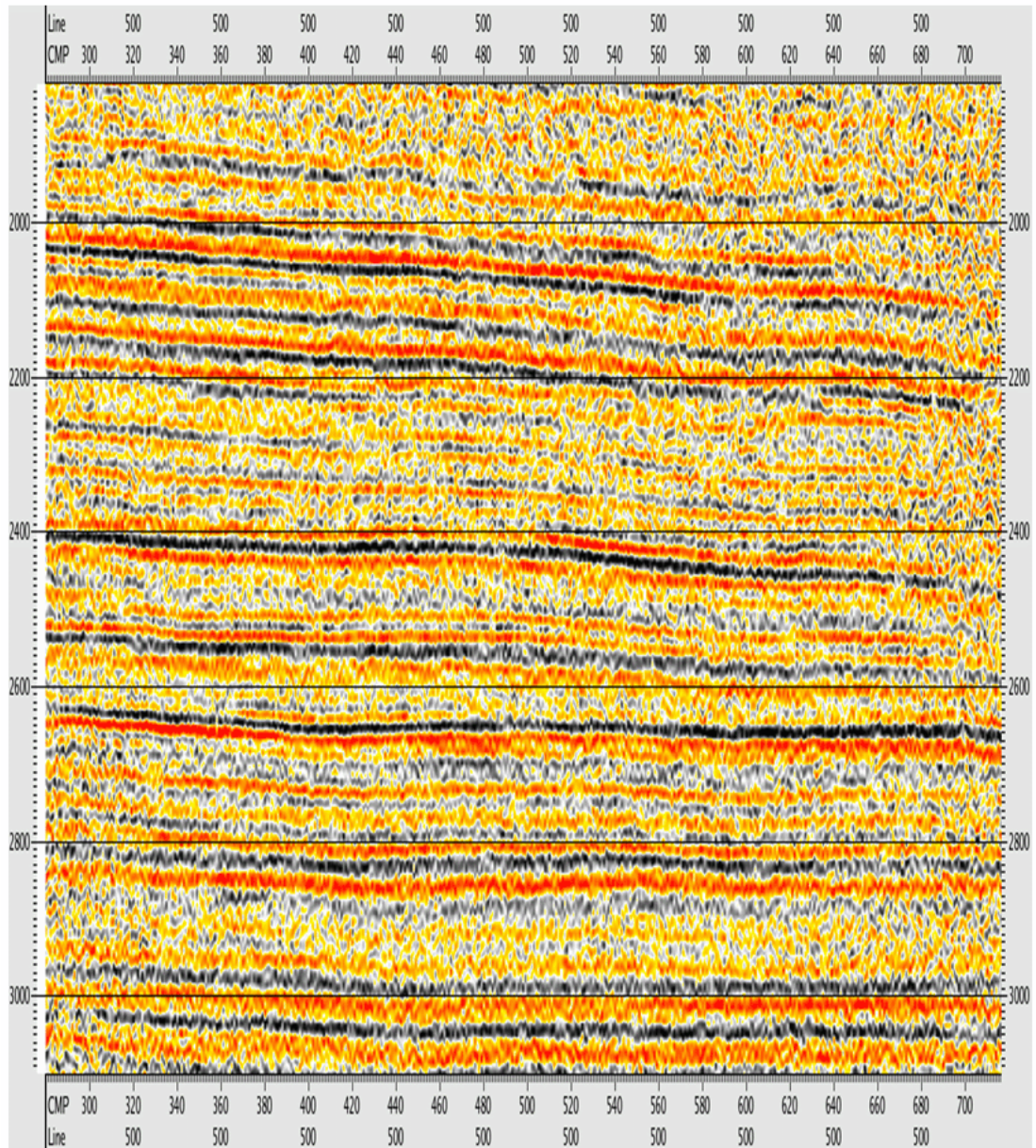
Pre-stack Q-absorption compensation